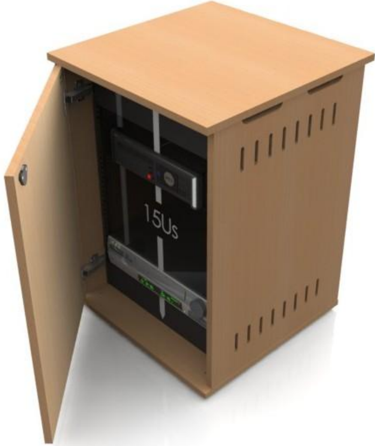
Front view Fitted with rack strip