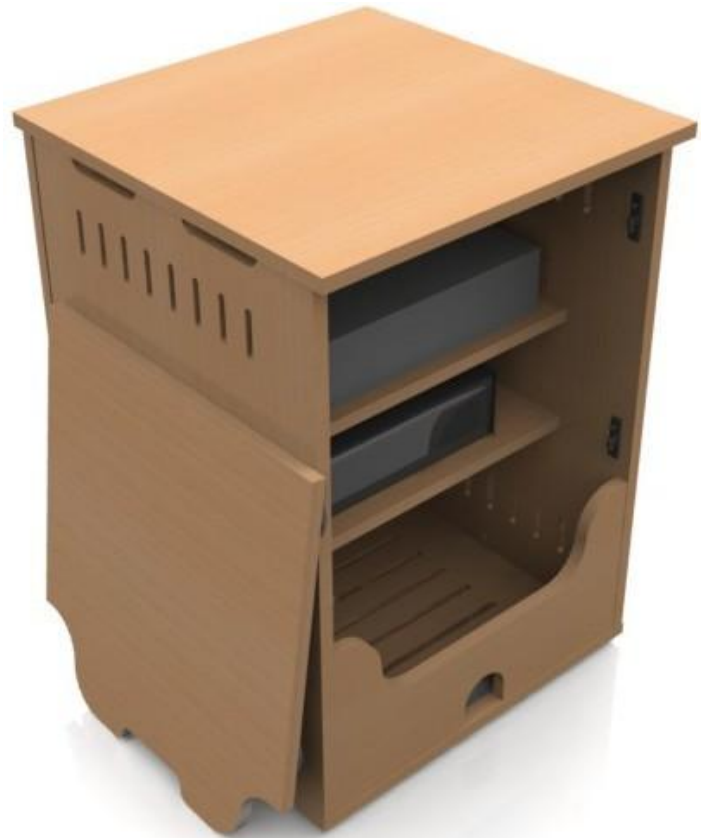
Rear view Fitted with adjustable shelves